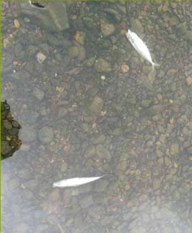
Waterblasting waste can have harmful effects on our aquatic life

It is illegal and harmful to discharge waterblasting waste into the stormwater system as it can negatively affect the quality of our environment. It is your responsibility to prevent unlawful discharges from your waterblasting activities. Make sure you put appropriate controls in place before you start.