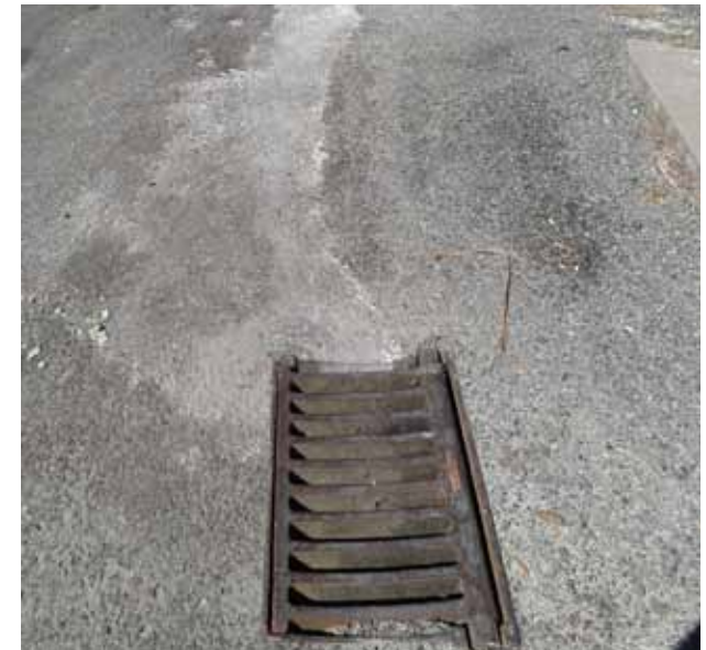
Only clean rainwater should enter our stormwater drains